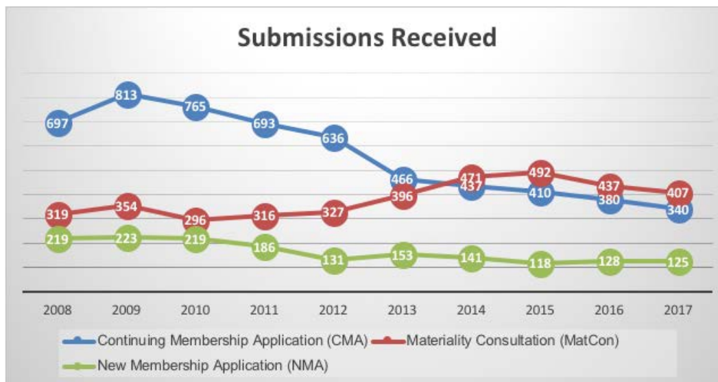
Figure 1: Number of NMA, CMA and MatCon submissions received, on an annual basis, for the period 2008 through 2017.

As displayed in Figure 1 below, in 2017, the Department received 125 NMAs, 340 CMAs and 407 materiality consultations (known as "MatCons"). Over the past 10 years, from 2008 through 2017, the number of NMAs and CMAs the Department has received has decreased, but the number of MatCons the Department has received has increased. The decrease in the number of CMAs could be due to the increased use of MatCons.