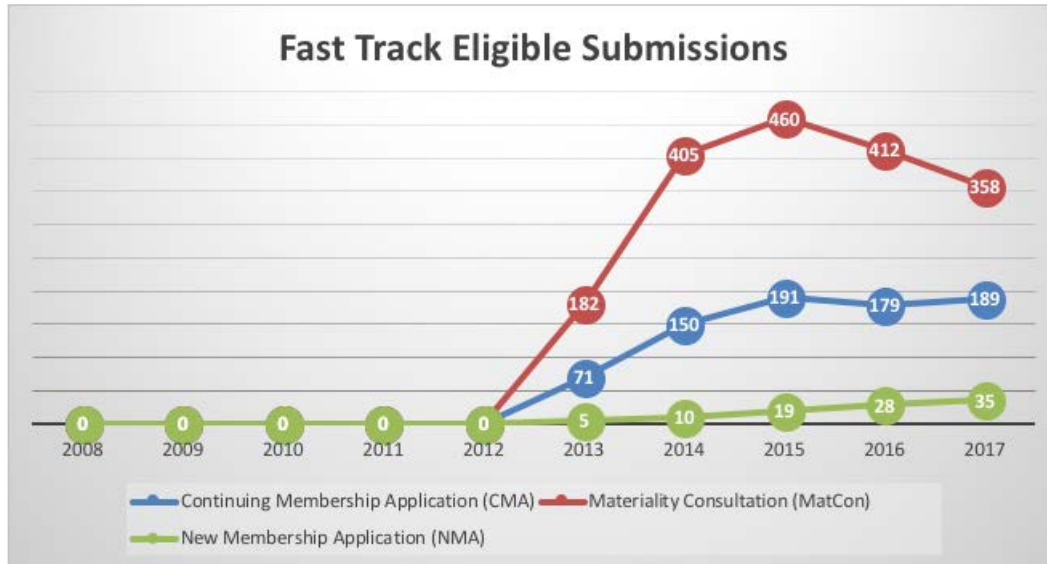
Figure 3: Number of NMA, CMA and MatCon submissions eligible for Fast Track review, on an annual basis, for the period of 2008 through 2017.

After the Department considers various factors as described in proposed Rule 1112.01, an application may be eligible to undergo Fast Track review. As an option that is provided to the applicant, FINRA believes that a firm is likely to agree to the expedited processing if the incurred cost savings are deemed to be greater than the increased costs ( e.g. , faster turnaround times for document requests) resulting from the expedited nature of the process. However, some firms may not want to expedite the application, as they will deem that such a process will not provide a net benefit and thus opt to go through the standard processing track. Shortening the timelines could potentially benefit the investor community by enabling the firms to provide services to their customers more quickly. As with the other efficiency improving process changes, risks to investors could arise from the expedited nature of the process, potentially leading to applications being approved that should not have been.